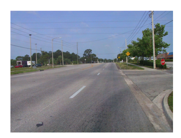
Figure 4. View of roadway before RRFB.

The before condition of the trail crossing (Figures 4 and 5) at 22^{nd} Avenue North did not have a median of any kind, and the consultant recommended that a striped, center refuge island be installed due to the numbers of interacting trail users and motor vehicles at the crossing.