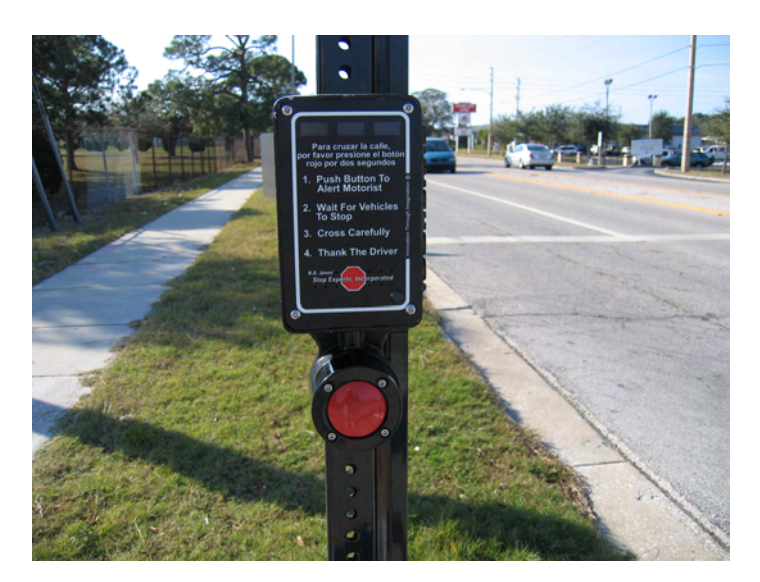
Figure 3. Push button configuration at the trail crossing.