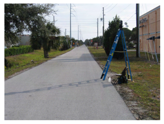
Figure 6. Videotape data set up.

The experimental design was to collect data of trail users before and after the installation of the RRFB. Videotape data were collected by a staff person from HSRC during several time periods before and after installation. A camera was set up on a stepladder beside the trail and several hundred feet from the actual trail crossing, and videotape was collected from both directions of travel (Figure 6). Data were collected at various times of the day on both weekdays and weekends when it was not raining.