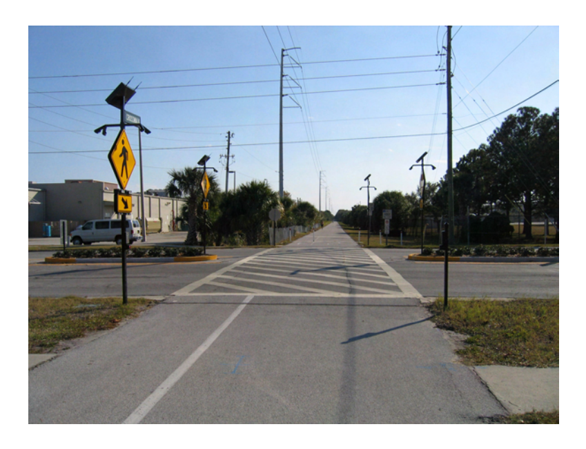
Figure 2. RRFB at the Pinellas Trail crossing.

The decision had been made by the Neighborhood Transportation section to install a safety treatment at a street crossing with the Pinellas Trail. A consultant examined candidate locations and recommended that a RRFB be installed at 22^{nd} Avenue North and the trail. This was the device previously evaluated at uncontrolled pedestrian crosswalks in St. Petersburg and described in the introduction and literature review. The RRFB system was installed on August 2, 2008 (Figures 2 and 3) and included beacons and signs on the edge of the roadway and in the median, as well as a push button to activate. The vendor was Stop Experts, Inc., and the cost of the system was $26,050.