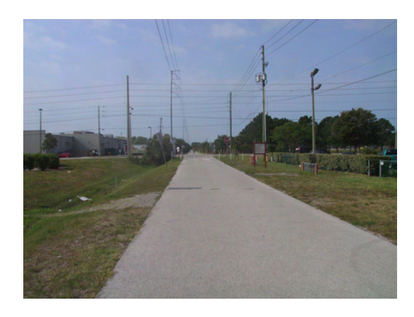
Figure 5. View of trail before RRFB.